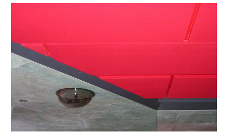
Fig. 2 Serenity Ceiling Panels can be custom made to fit room dimension as seen here.