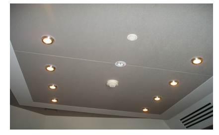
Fig 1. Serenity Ceiling Panels can be designed to fit around existing services, or even incorporate new services, such as lighting.