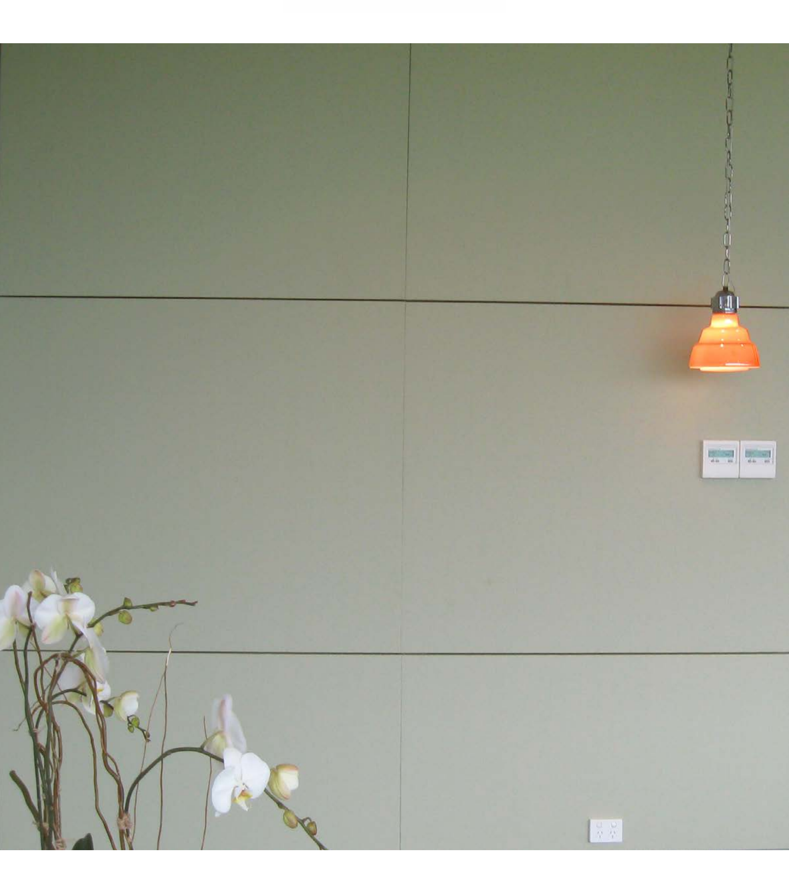
SERENITY FABRIC ACOUSTIC PANELS