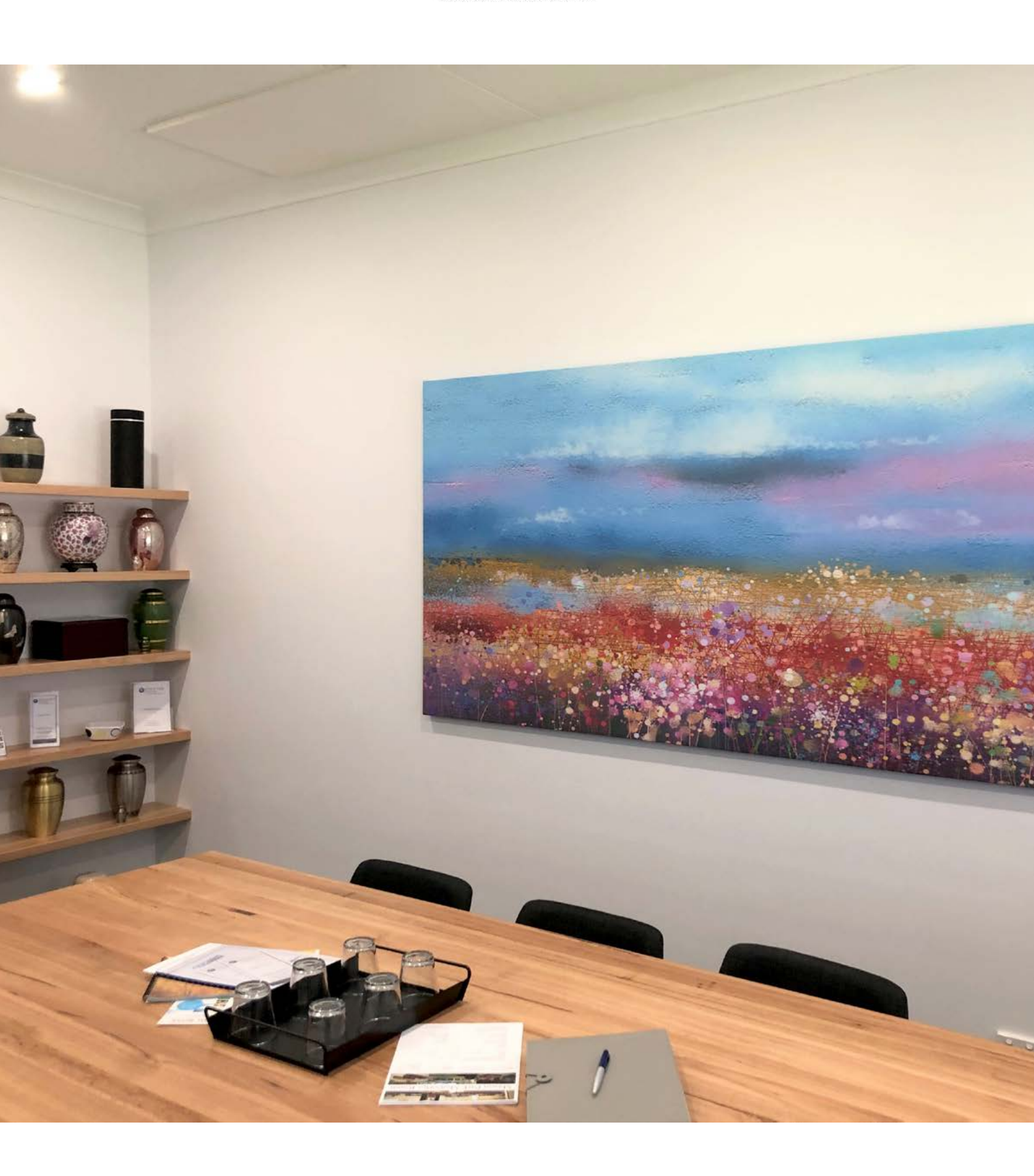
SERENITY ART ACOUSTIC PANELS